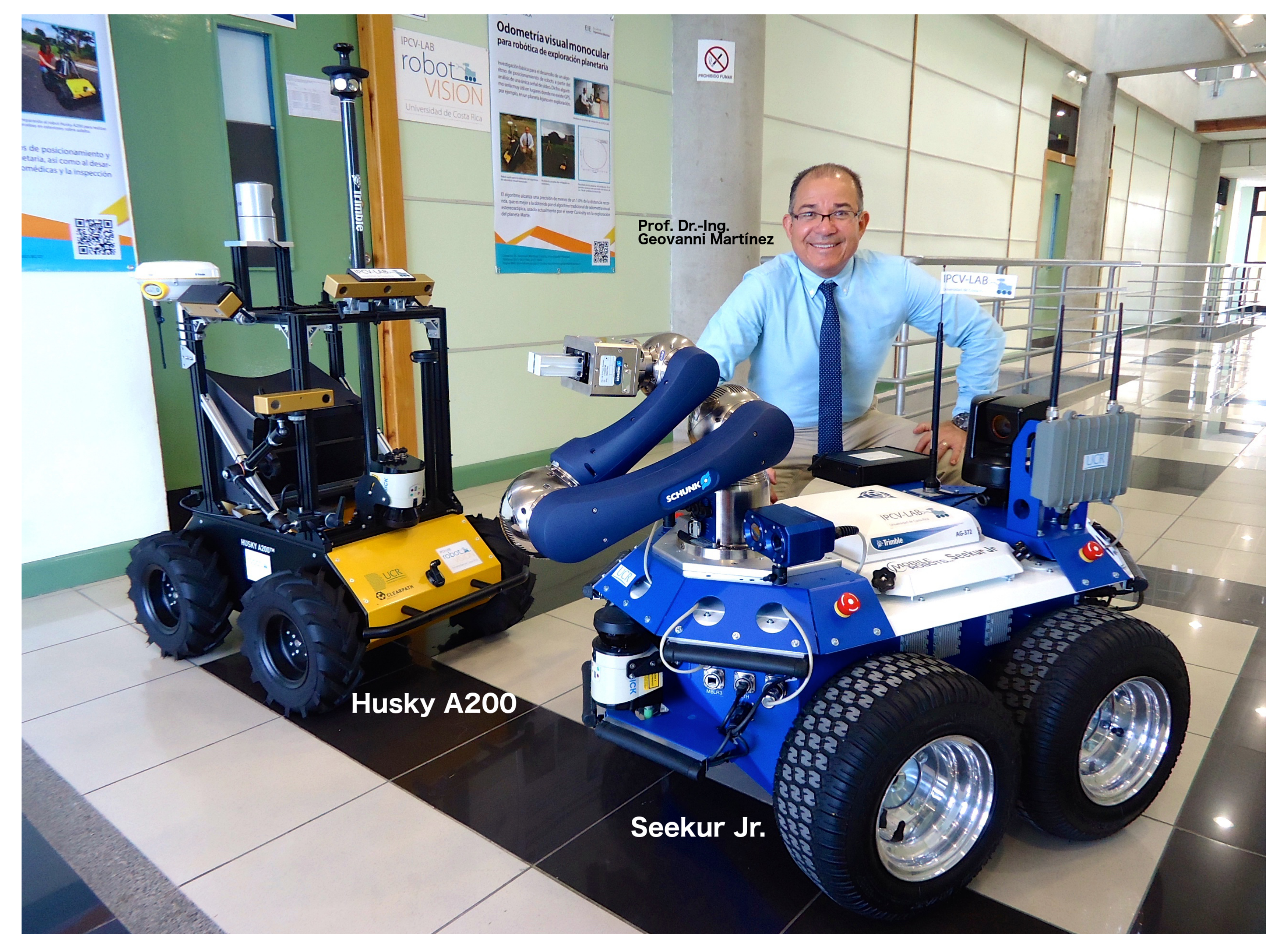
Figure 1: Robots used to test the new NIR ToF odometry and SLAM technologies developed at the IPCV-LAB for autonomous navigation systems.

Currently we are extending the algorithm to simultaneously map the location the robot has passed through, in order to transform it into a monocular NIR ToF simultaneous localization and mapping algorithm, which we have named direct monocular NIR ToF SLAM.